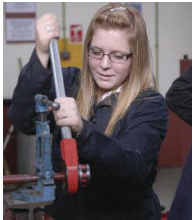
■ A MidKent College construction trainee.

Planning permission has been granted for the centre and construction began at the beginning of December. It is anticipated the centre will be completed in about 12 weeks with lessons starting after Easter.