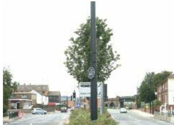
■ Corporation Street showing the junction at Northgate

Further information on these proposals can be found at www.medway.gov.uk/corporationstreet