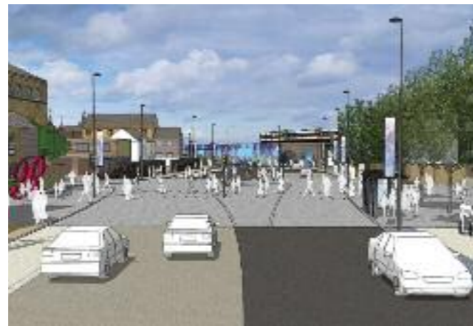
■ A computer generated image of the same view following improvements